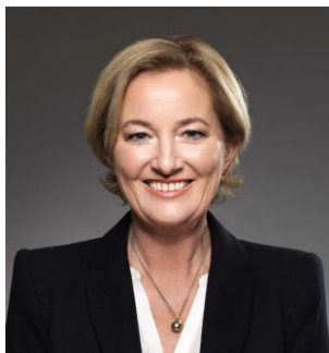
Mrs Paulette Lenert