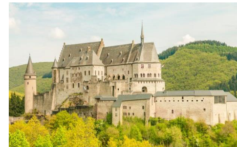
Protecting natural & cultural assets