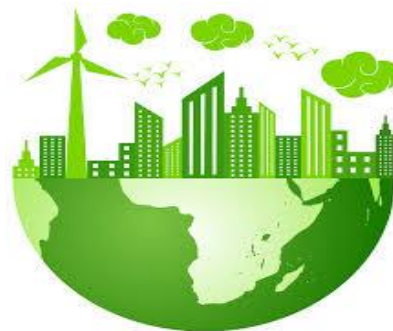
Innovating cities for sustainability & resilience